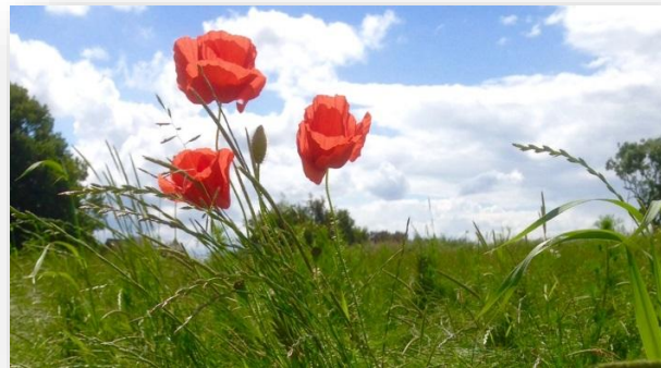
A meadow and woodland burial for remembrance